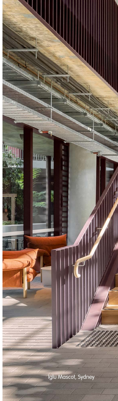
Iglu Mascot, Sydney

T: +61 2 8000 3580 E: summerhill@iglu.com.au